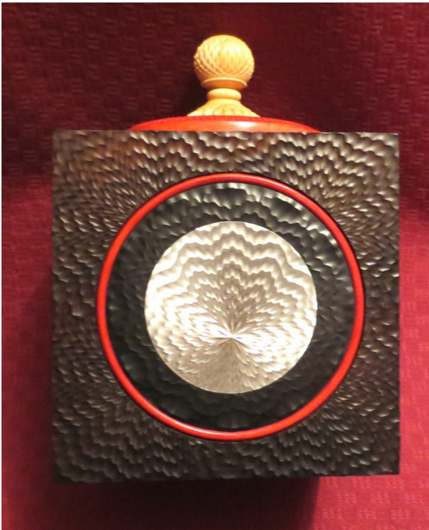
Gold and Silver coin shapes represent the wealth of the City.